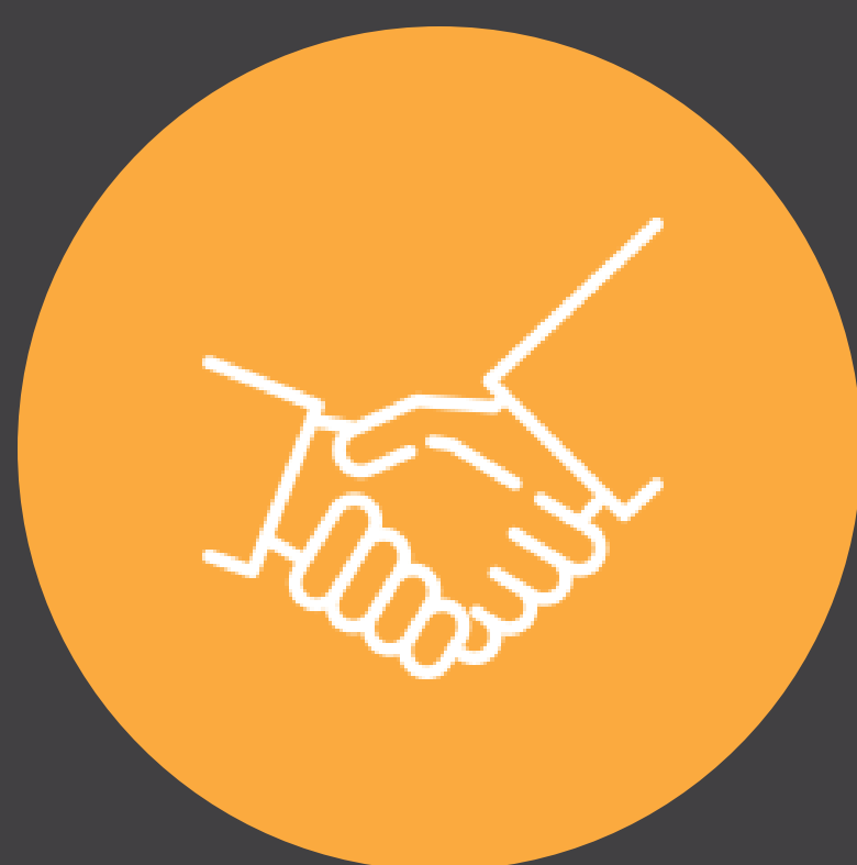
Introductions & ice breakers