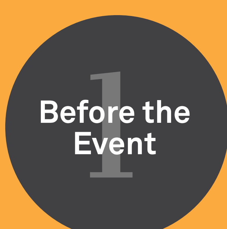
Before the Event

To enhance inclusion and reduce potential anxiety, there are a number of processes and practices that are helpful. These should be considered early in the planning phase to enable event management to be responsive to participants' needs. Inclusive Processes and Practices can be categorised as: