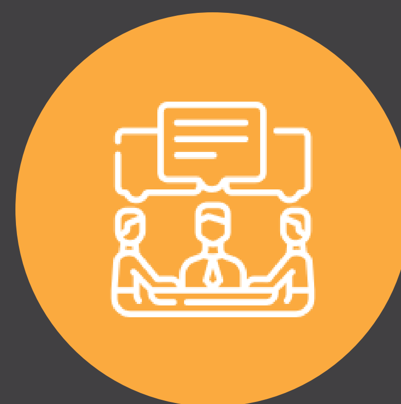
Group work & discussions