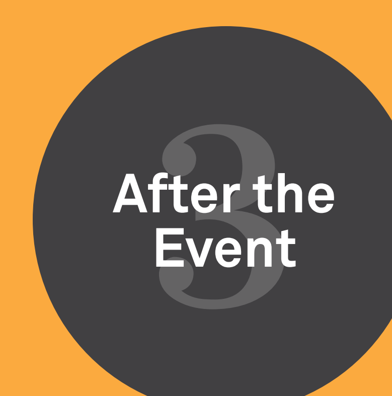
After the Event