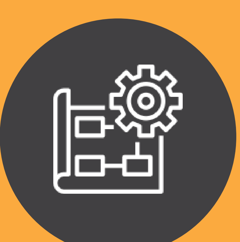
Room use and set up