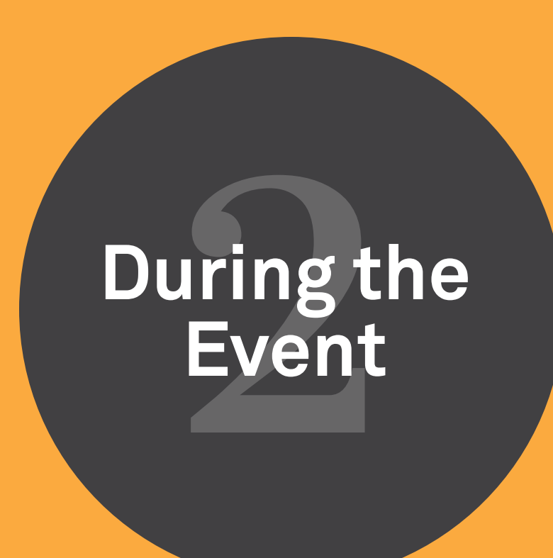
During the Event